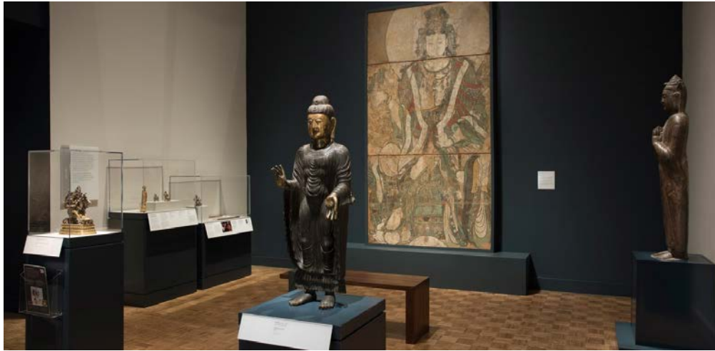
Robert and Katherine Jacobs Asian Wing, eight newly expanded galleries at Detroit Institute of Arts