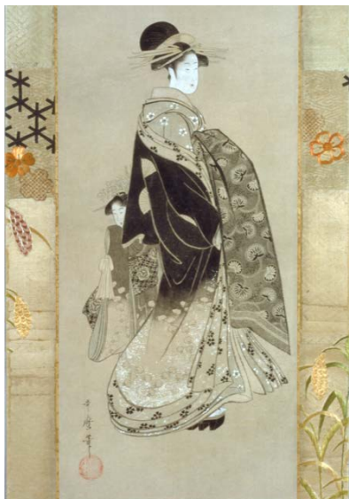
Courtesan in Procession , Kitagawa Utamaro, 1793–1795, ink, white pigment, and red color on paper.

Morning, our private tour of University of Michigan Museum of Art Asian collection led by curator of Asian Art. UMMA is noted for its Japanese painting collection which will be the focus of our tour. The museum is home to the largest collection of Asian art in the state of Michigan.